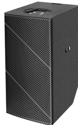
700W Professional Passive Line Array Speaker LA-6500